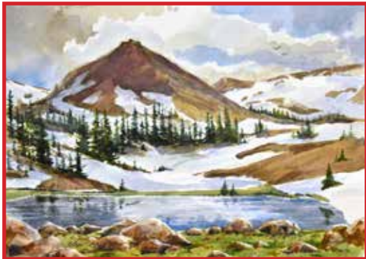
Brian Serff Rogers Lake