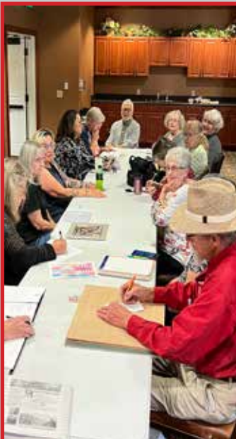
The long meeting table