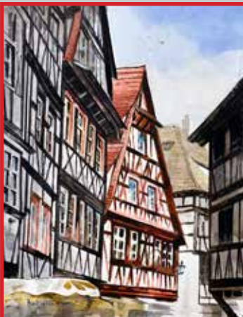
Brian Serff Watercolor "Stasburg"