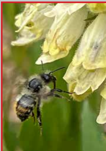
"Looking for pollen"