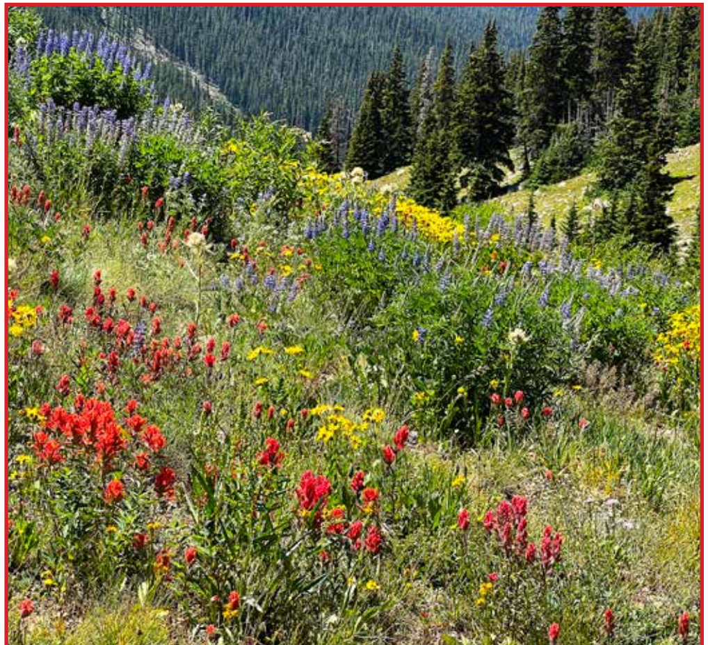
"June flowers"