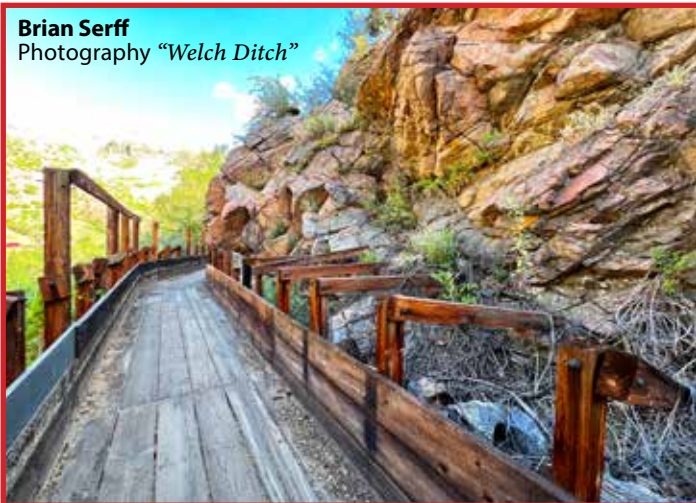
"Welch Ditch"

7388 S. Revere Parkway #702 • Centennial, CO 80112