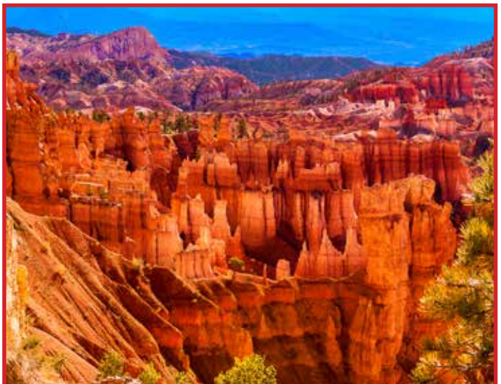
Bryce Canyon from Sunset Point, Rodney Buxton