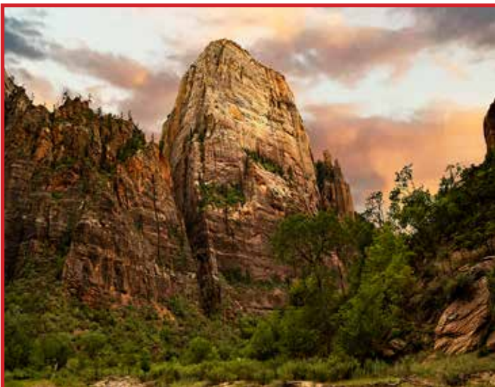
Great White Throne at Sunset, Rodney Buxton