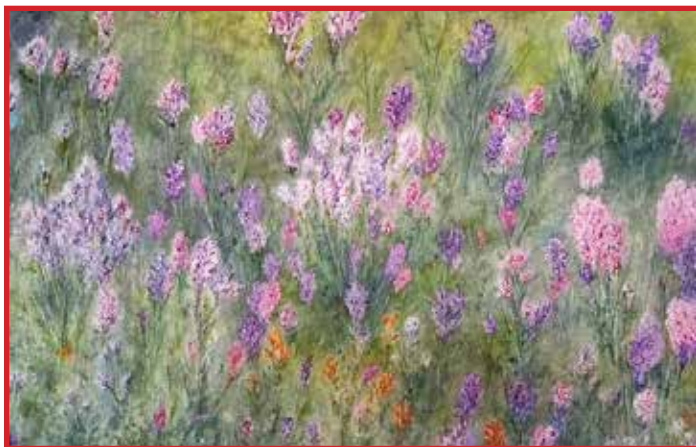
Field Of Flowers By Trista Robrahm

Aurora Muncial Center venue to be rescheduled to July. Look for email that will give the dates and times.