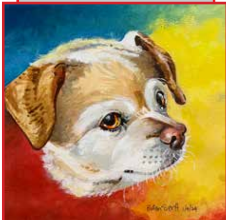
Watercolor by Brian Serff Doogle the Dog