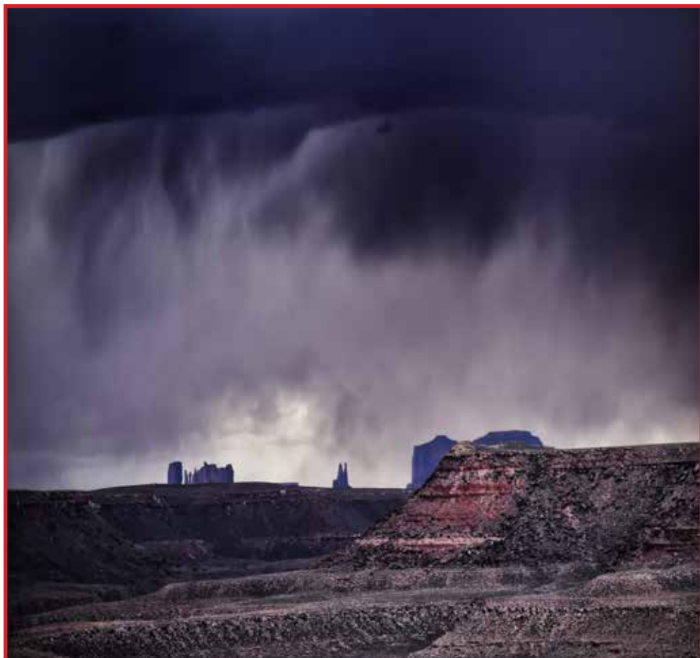
Photography Storm over Monument Valley By Brian Serff

Lets all listen to our bodies!!! Create when you can. Rest when you need to